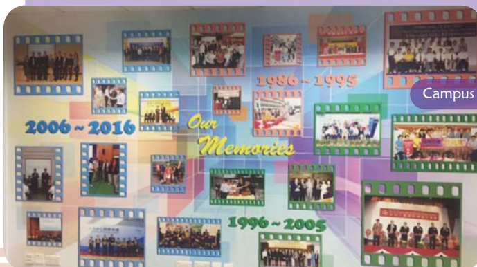
Campus History Gallery