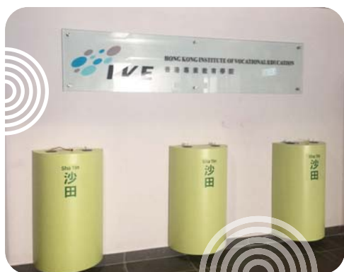
mobile phone charging stations