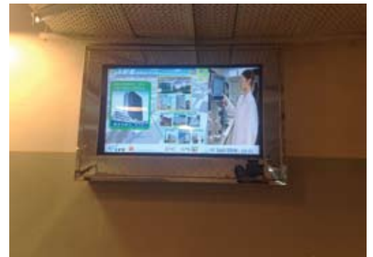
4. The wall next to staircase A on G/F

The following content materials have been suggested by various departments and were put in the DSS: