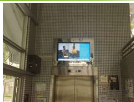
2. At the New Annex lift on G/F