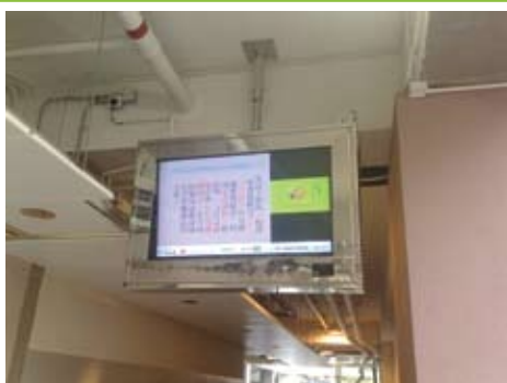
1. Wo Che entrance on G/F

It has been scheduled to be operated at 8:15 a.m. – 10 p.m. from Monday to Saturday. The LCD TVs have been installed at the following four locations in our campus: